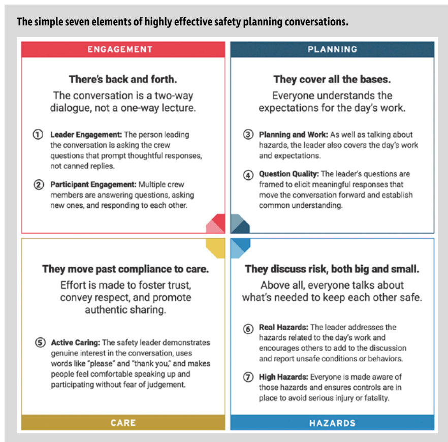
FIGURE 1 SIMPLE SEVEN

7) High hazards: Are serious precursor conditions for potential fatalities and life-altering injuries being recognized?